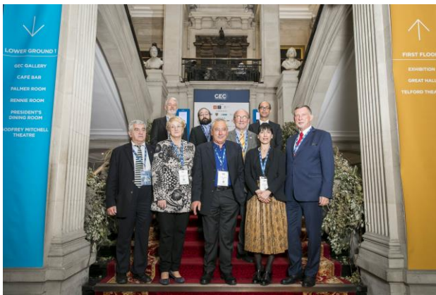
New ECCE ExBo 2018-2021

The General Assembly of the European Council of Civil Engineers (ECCE) has elected a new Executive Board at the ECCE Executive Board Elections that took place on 23 rd October 2018 at the 68 th ECCE General Meeting in London, U.K.