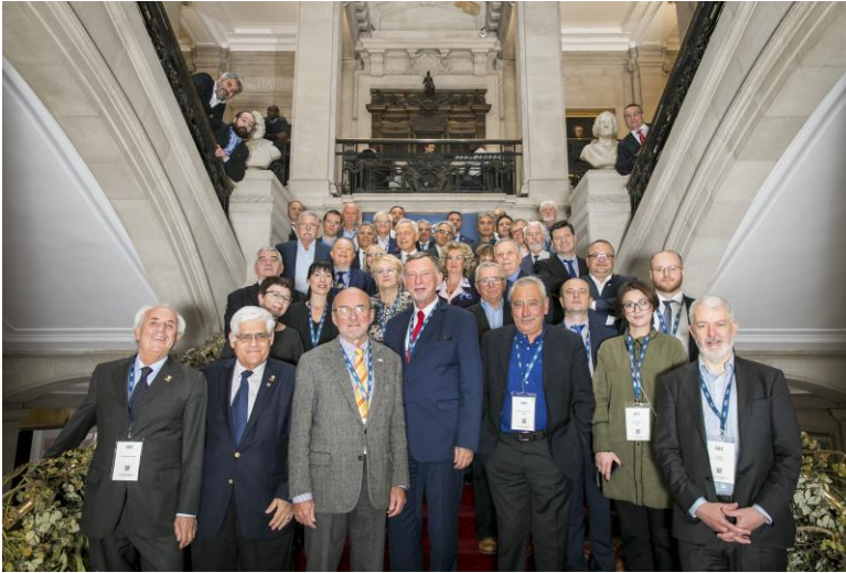
68 th ECCE General Meeting participants

The 68 th ECCE General Meeting was held on 22 nd – 23 rd October 2018, in London, U.K., hosted by the Institution of Civil Engineers (ICE). This meeting has been held in parallel with the Global Engineering Congress (GEC) that was organized as part of the ICE 200 bicentenary programme, the 50 th anniversary of WFEO and the UK Government's Year of Engineering. The GEC was organized in association with the American Society of Civil Engineers (ASCE), the Canadian Society of Civil Engineers (CSCE), the