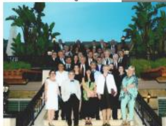
65th ECCE General Meeting group photo

The 65th ECCE General Meeting was held on 2 nd - 3 rd June 2017, in Antalya, Turkey, hosted by the Turkish Chamber of Civil Engineers (TCCE). On 1 st June, the ECCE Executive Board meeting was held.