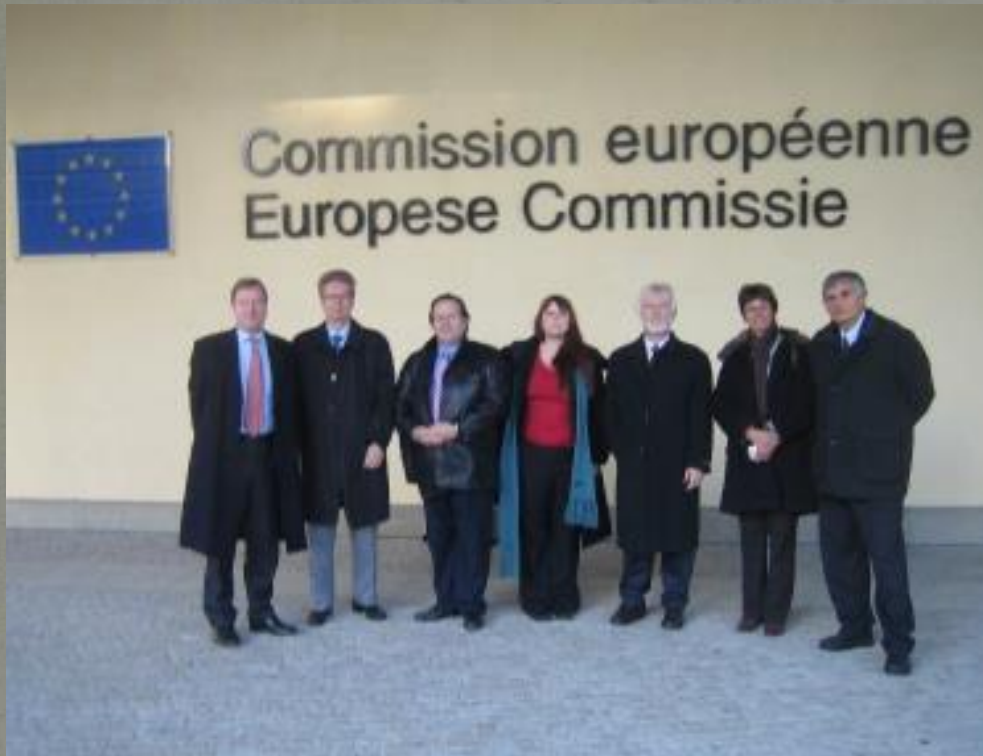
Meeting of ECCE ExBo with the EU Commissioner on Environment Mr. Stavros Dimas and visit of all ECCE delegates to the European Parliament