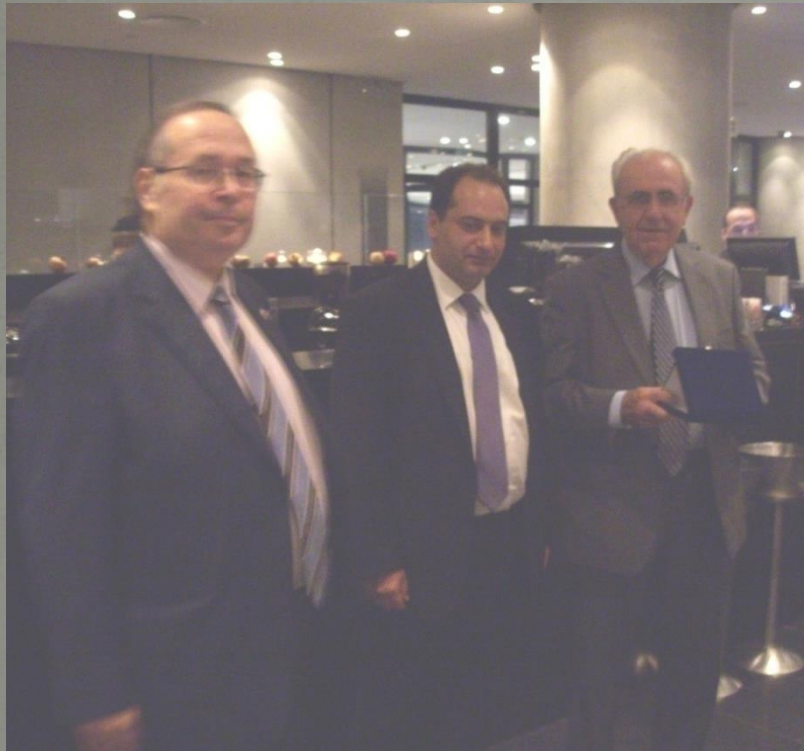
ECEC GAM, Athens, October 2013