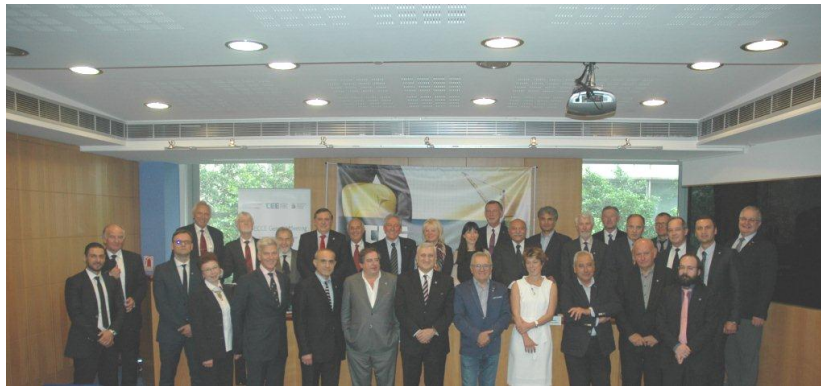
64 th ECCE GM participants

The 64 th ECCE General Meeting was held on 20 th – 22 nd October 2016, in Athens, Greece, hosted by the Civil Engineers Association of Greece (ACEG) and the Technical Chamber of Greece (TCG). The Round Table “Building the future: The road to prosperity is always under construction” was held on 20 th October 2016, organized by ACEG, TCG and ECCE, in the context of the 64 th ECCE GM.