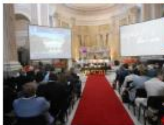
Conference "Artistic and Monumental Heritage – Restoration, Safeguard and Enhancement" at Basilica di San Giovanni Maggiore a Pignatelli