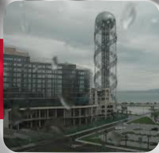
New Hotels 2009-2013