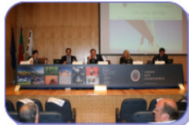
Conference "Changes in Civil Engineering"

In this situation, many of the construction companies, without work in Europe, had only one way to survive: to internationalize, meaning to move to the countries where public investments exist, namely in South America, Africa and Far-East. With them went the engineers, the architects, and in general all the members of the construction cluster. Several European construction companies